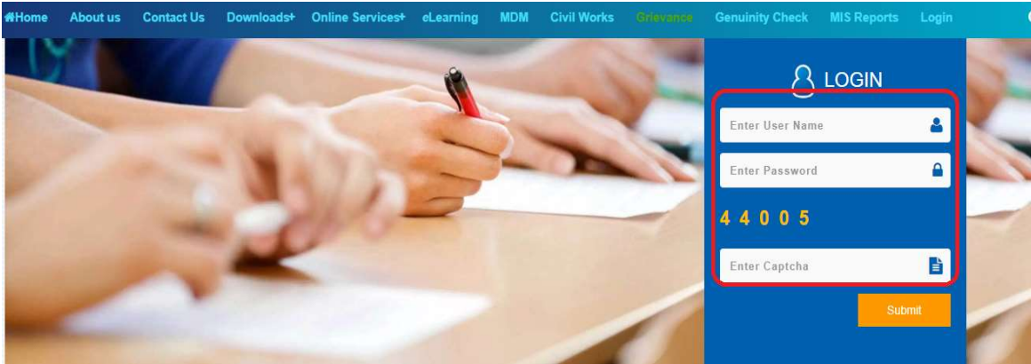
Figure 1 : login details