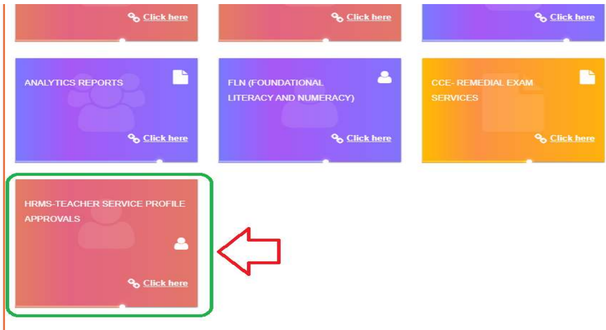
Figure 2 :- Service selection