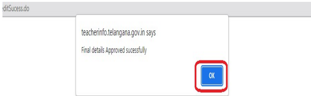
Figure 12 :- Success message